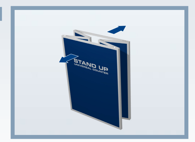
Take the frame out of the bag and fold out the back and front.