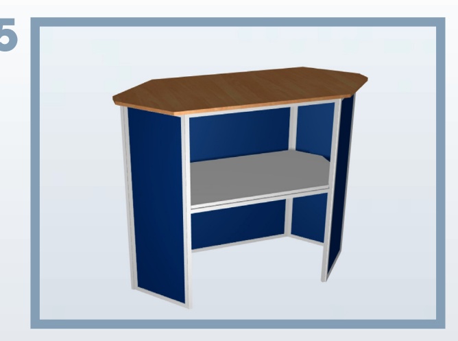
Place the counter on a level surface as possible and check the stability.