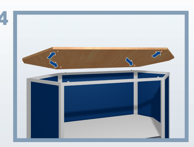
Place top shelf and fix its position by allowing the four screws to go into the holes on the lower surface of the top shelf.

Lock the structure by allowing the hooks at the front and rear of the shelf to fall into the slots on the system's shelf rests.