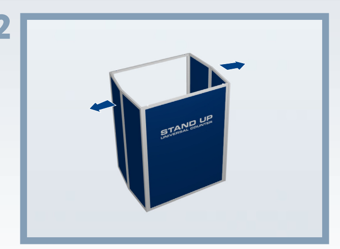
Continue to unfold the system by pushing the end sides outwards.