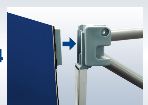
Click the hangers on top of each graphic panel onto the magnetic slot located on the magnetic bars. Let the panel fall down into place.