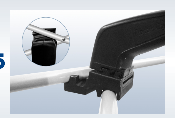
Attach the lights to the top scissor of the system. The tracks in the spotlight fastener will guide it to the proper location.